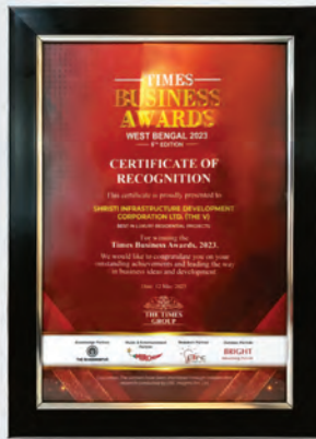
THE V, Kolkata awarded the 'Best Luxury Residential' by Times Business Awards, 2023 (East)