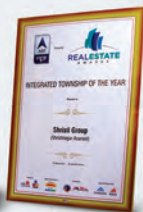
'Integrated Township of the Year' for Shristinagar-Asansol by ABP News