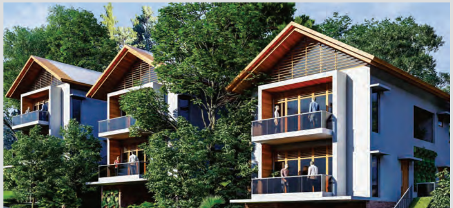
One Katha Plots