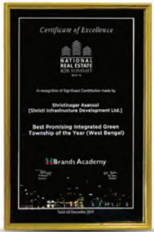
'Best Promising Integrated Green Township of the Year' for Shristinagar-Asansol by Brands Academy in association with NDTV