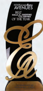
Estate Avenue's 'Best Malls and Shopping Centres of the Year'