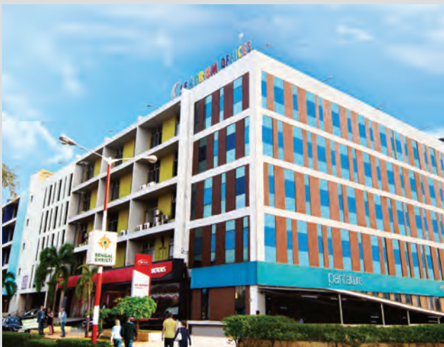
Sentrum Office Block