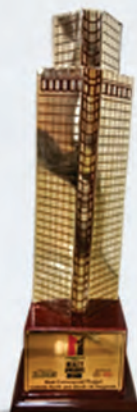
'Best Commercial Project outside North and South 24 Parganas of the Year' for Shristinagar-Asansol