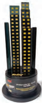
Shristi Group has been awarded the 'Best Developer - Townships' category at the Realty+ Conclave & Excellence Awards, 2019 (East)