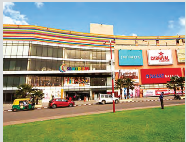
Sentrum Shopping Mall