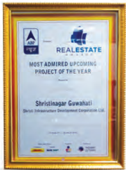
'Most Admired Upcoming Project of the Year' for Shristinagar-Guwahati by ABP News