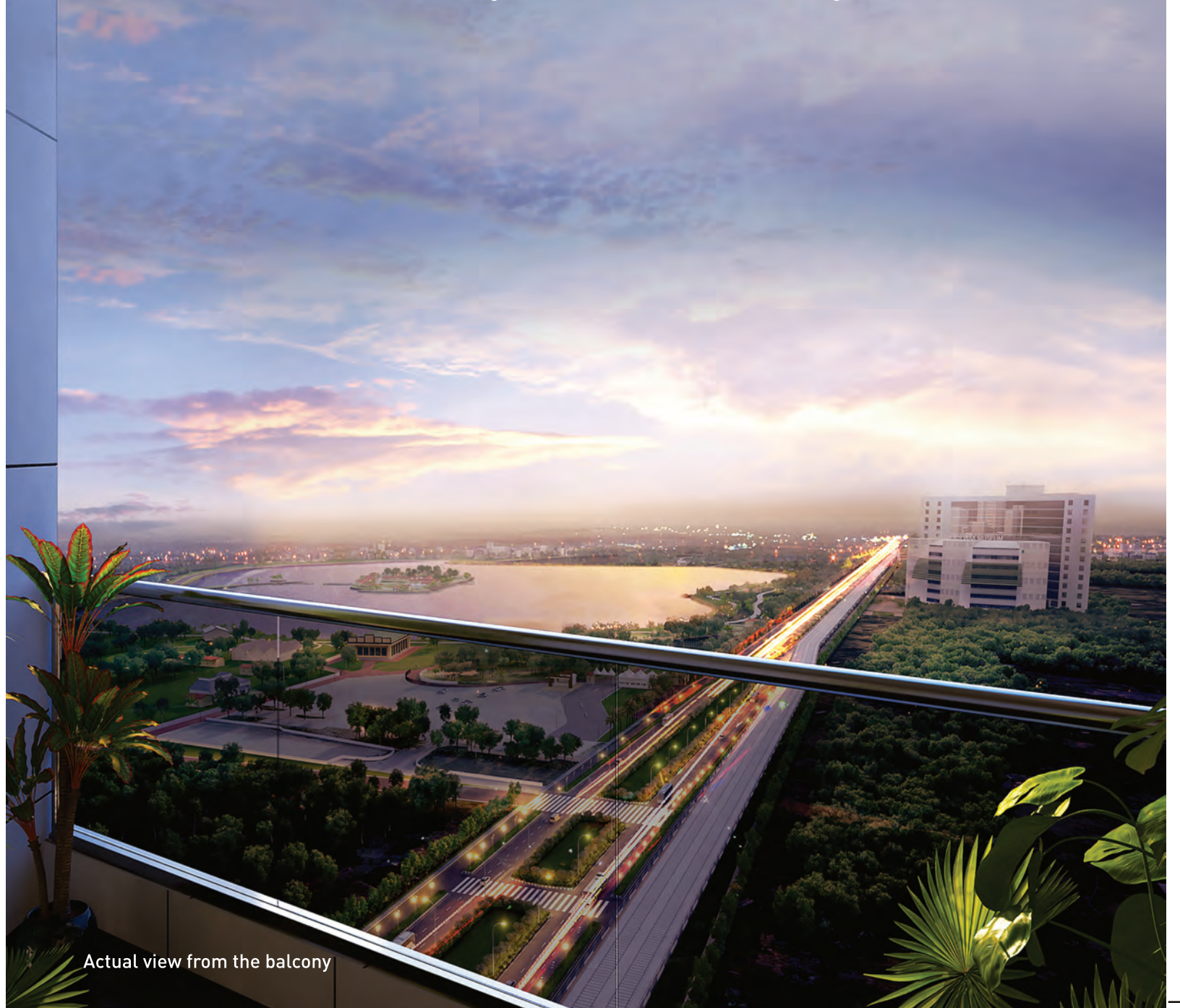
Actual view from the balcony