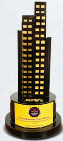
Shristinagar Guwahati awarded the 'Best Township of the year' by the Realty+ Conclave & Excellence Awards, 2023 (East)