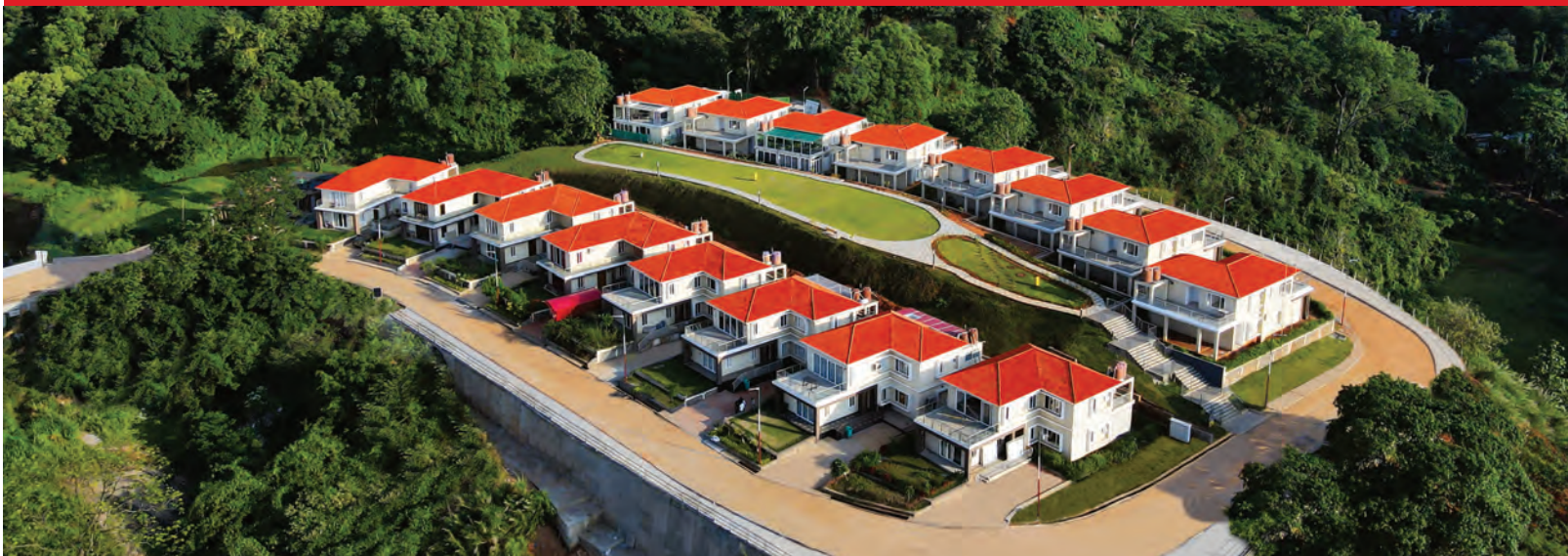
Actual view of the Villas